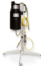
VAS Flushing Kit 134a/1234yf