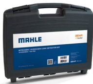
Nitrogen/Hydrogen leak detector Kit