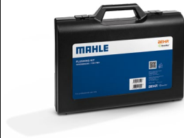
Flushing Kit R1234 M